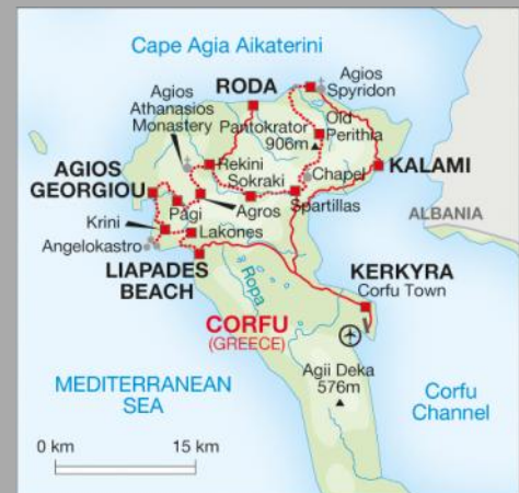
Walking the Corfu Trail (North) FA