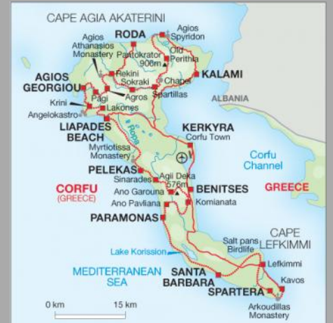
The Corfu Trail Explorer CFA